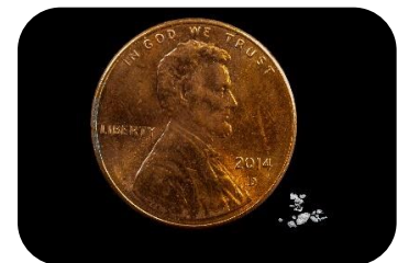
Just 2 milligrams of fentanyl—the size of 3 grains of rice—can cause an overdose.