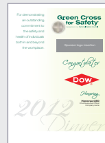
FULL PAGE (NO BLEED) 7 1/2" x 10"