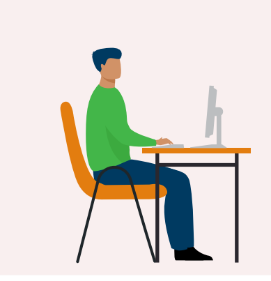
Only the "average-sized" worker can achieve safe, proper posture with feet grounded and elbows at a comfortable height.